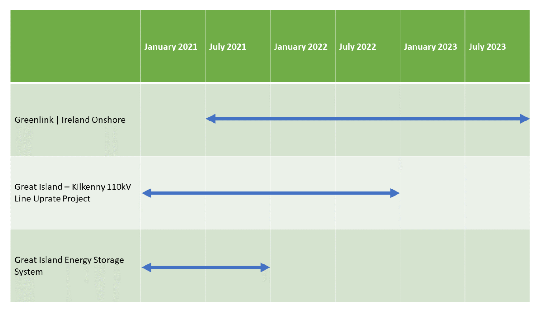
Figure 18.2: Possible overlap in construction timing and durations

Note - Timing and durations indicated in the figure above represent construction durations as outlined in their respective planning documentation (with a start date of 6 months post grant of planning unless otherwise stated in the planning documentation).